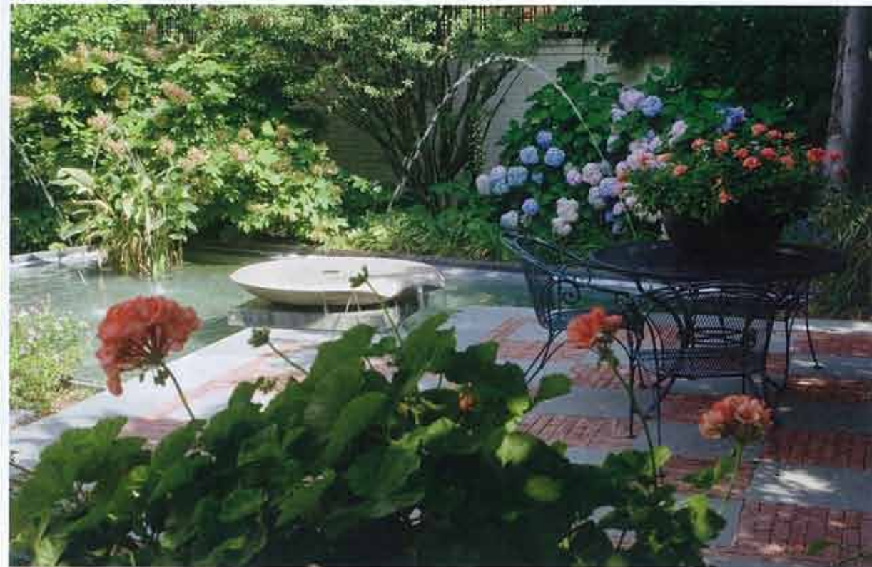
Aquatic plants floating in the water include American lotus, water lilies, hardy water canna, and pickerel weed. SerraStone Corporation installed the checkerboard hardscape.