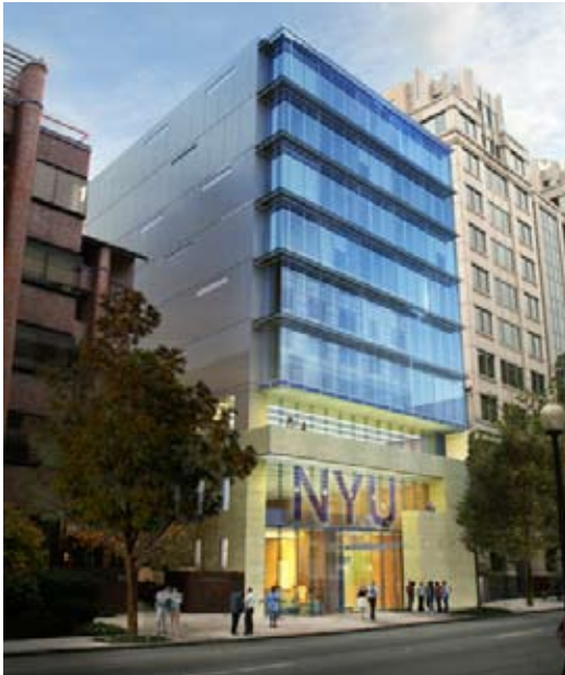
New York University © Courtesy Hickok Cole Architects