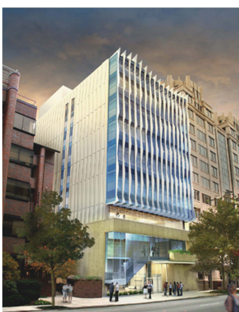
Rendering of the New York University Constance Milstein and Family Academic Center designed by Hickok Cole Architects