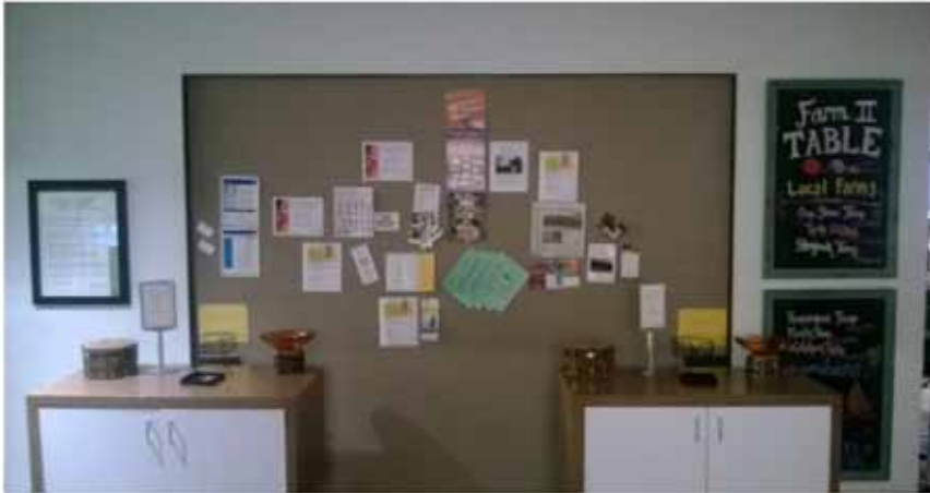
Employee bulletin board

On-site amenities and services from an employer should not be seen as a way to get employees to work longer hours. Rather, companies have come to understand that employees perform better quality work when their work-life balance is optimized. Therefore, new office environments are being designed to accommodate personal needs and demands too.