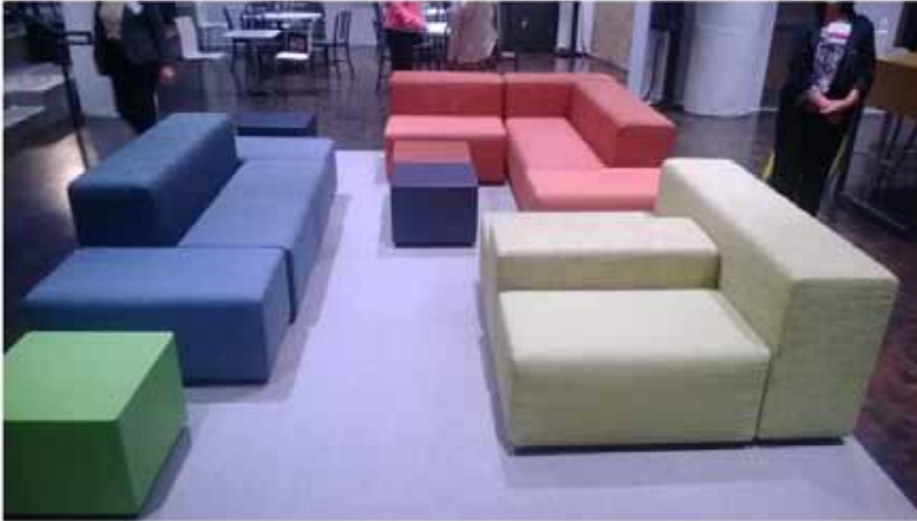
The lounge area acts as a place to socialize as well as continue working

The "third space" is by its own nature a very flexible place - with its platform stage it can host company-wide events such as guest speakers or talent shows and minutes later be converted into a social gathering or eating area. Even though the room is not used for organized work, employees may use the lounge area to quietly do work-related tasks if they please.