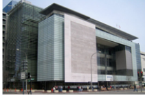
Newseum / Courtesy Wikipedia