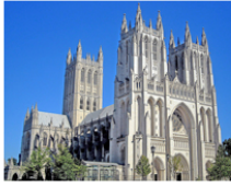
National Cathedral