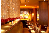
Rasika Restaurant