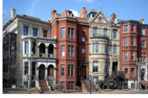
Logan Circle