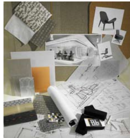
Blackboard, Inc. material finishes