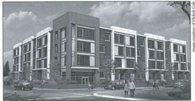
16th & Constitution by Hickok Cole Architects

Hickok Cole Architects is nearing the final stages of design development for 16th & Constitution - an urban workforce housing development driven by a strong commitment to sustainable design and respect to the urban fabric. The design champions cross ventilation and light from all