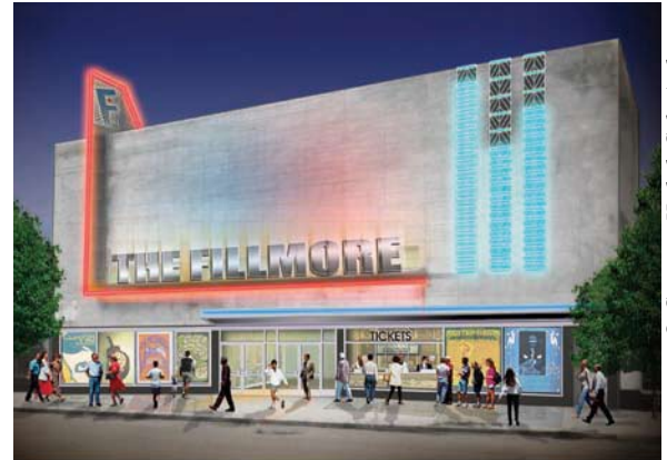
Proposed Design: The Fillmore